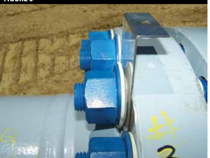
Over-compressed white isolation washer.

tolerances and holding to exacting design, quality, and raw material standards.