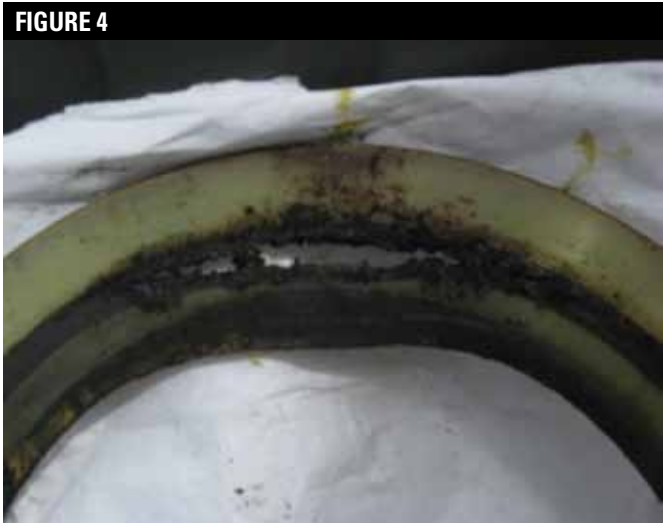
A gasket from a treated water dump.

though the original specification is absent, the gasket obviously was not made properly for the intended application.