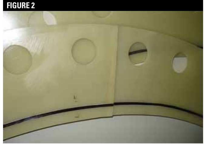
The gasket for a water project failed the initial hydrotest.