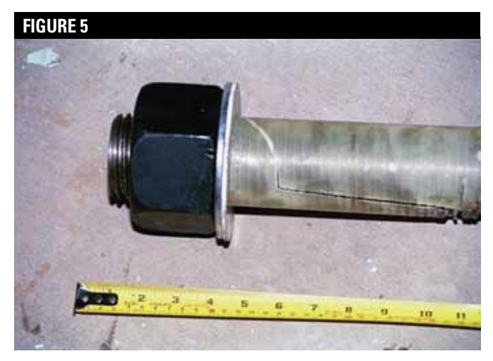
Bolt sleeve failure from shear stresses.