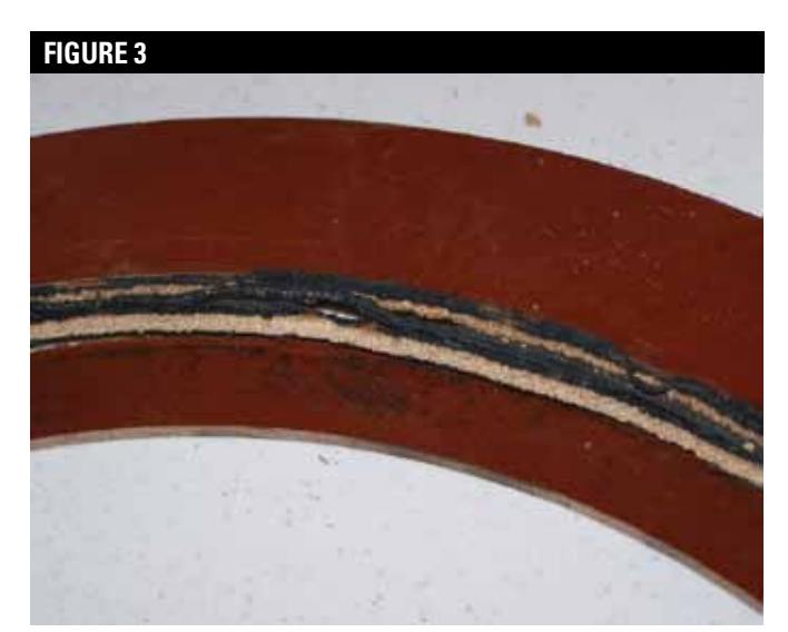
A gasket for a natural gas project.