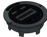
Cast-Iron Cover Import & Domestic 15 lbs

Markings are embossed into the cover. Ring & Cover are available in imported and USA-made versions